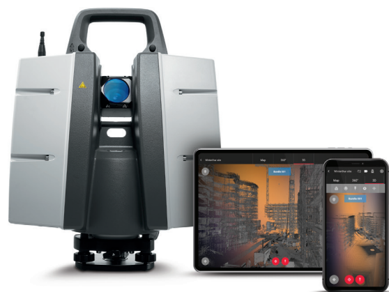
Leica ScanStation survey-grade, 3D laser scanner and Leica Cyclone FIELD 360 mobile-device app.

Platform Android tablet or phone running on Android 10.0 or higher on 64-bit ARM architecture with 64-bit operating system and at least 4GB of RAM. Recommended devices: Samsung Galaxy Tab S8, Tab S9, Samsung Galaxy S22, S23 series. Apple iPad or Apple iPhone running on iOS16 or higher with 64-bit operating system and at least 4GB of RAM. Recommended devices: iPad Pro 11 (2021, 2022) and iPhone 13, 14, 15 series. For first generation BLK360 scanners, iOS devices are recommended.