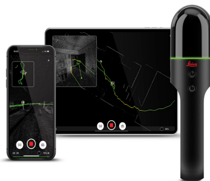
Leica BLK2GO handheld imaging laser scanner and Leica Cyclone FIELD 360 mobile-device app.

Download from Google Play Store and Apple App Store.