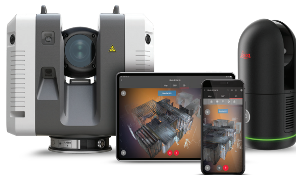
Leica RTC360 3D laser scanner with the Leica BLK360 imaging laser scanner and Leica Cyclone FIELD 360 mobile-device app.