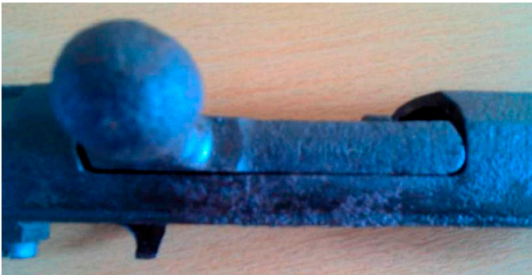
Photo of the number platform — elements of the number are not recognized