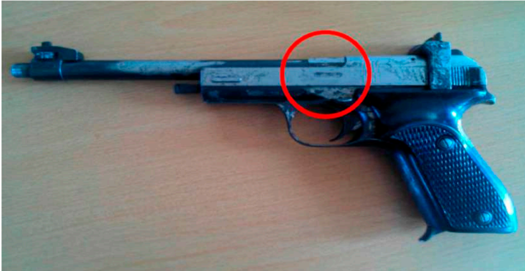
Object photo — the Mosin rifle with corroded marking