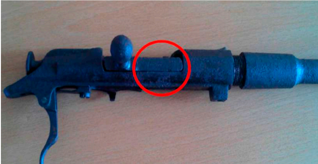
Object photo — the Mosin rifle with corroded marking