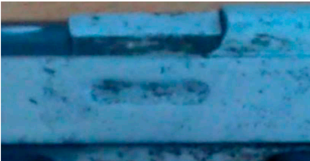
Object photo — the MCM pistol with the removed number