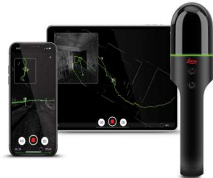
Leica BLK2GO handheld imaging laser scanner and Leica Cyclone FIELD 360 mobile-device app.

Download from Google Play Store and Apple App Store.