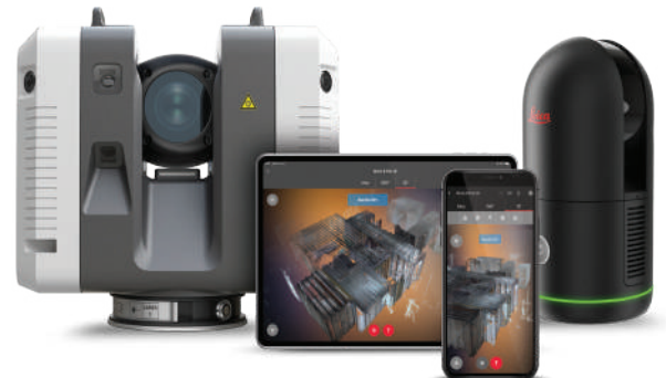
Leica RTC360 3D laser scanner with the Leica BLK360 imaging laser scanner and Leica Cyclone FIELD 360 mobile-device app.