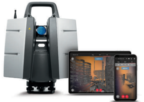
Leica ScanStation survey-grade, 3D laser scanner and Leica Cyclone FIELD 360 mobile-device app.