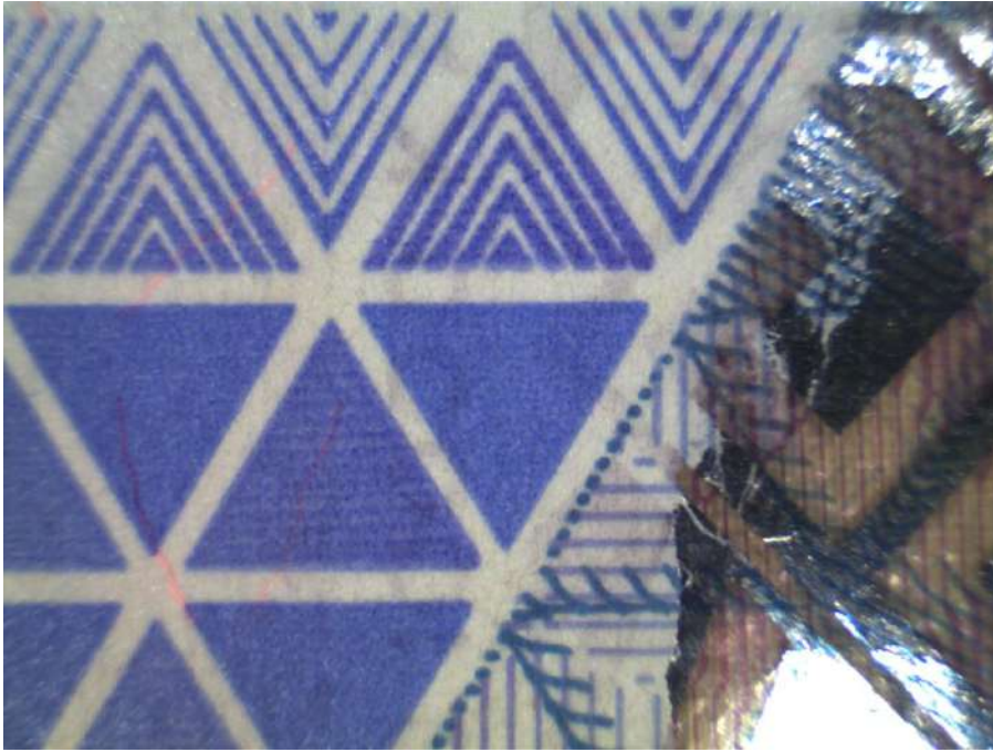
Spectral luminescent magnifier Regula 4177: White incident light 1x