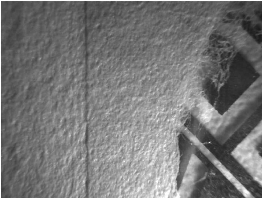
Spectral luminescent magnifier Regula 4177: Infrared oblique light (880 nm) 1x