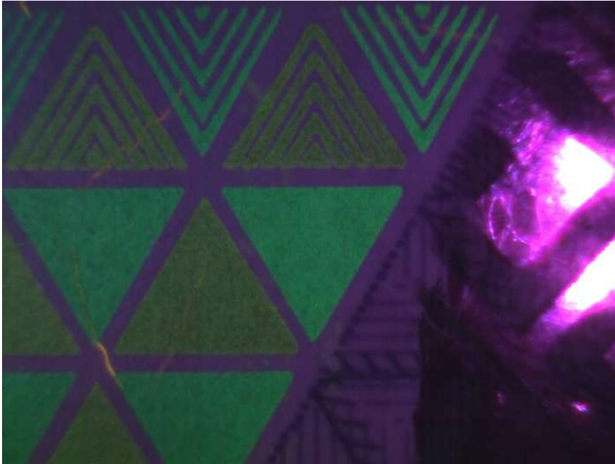
Spectral luminescent magnifier Regula 4177: Ultraviolet top light (365 nm) 1x