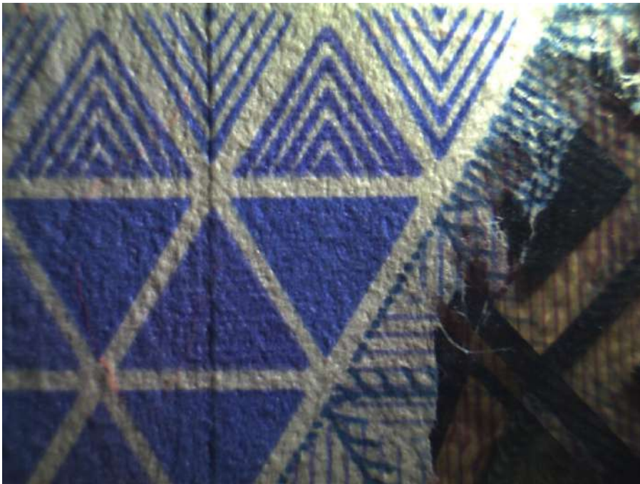
Spectral luminescent magnifier Regula 4177: White oblique light 1x