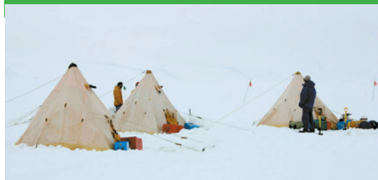
Antarctica - the source of RNA GEM ™ (Camp, Ross Ice Shelf)